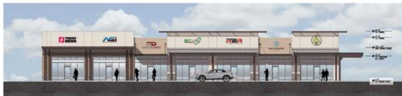
RETAIL BUILDING A FRONT ELEVATION