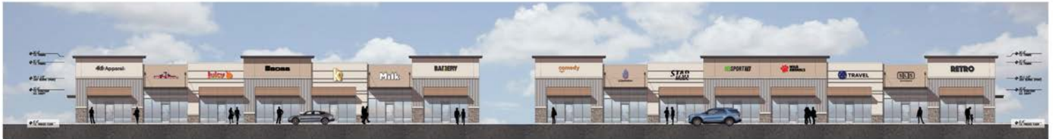
RETAIL BUILDING C & D FRONT ELEVATION