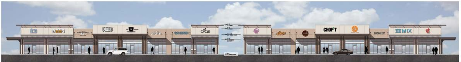
RETAIL BUILDING E & F FRONT ELEVATION