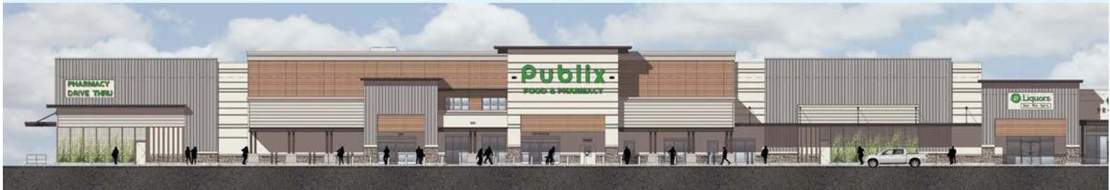
PUBLIX & LIQUORS FRONT ELEVATION

Disclaimer: The information contained in this brochure is provided for general informational purposes only. The estimated rentable area of the space is approximate and subject to verification. While every effort has been made to ensure the accuracy of the information presented, neither the landlord, property manager, nor their agents make any representation or warranty as to the actual rentable area. Prospective tenants are encouraged to independently verify the actual dimensions and square footage of the space prior to entering into any lease agreement. All information is subject to change without notice.