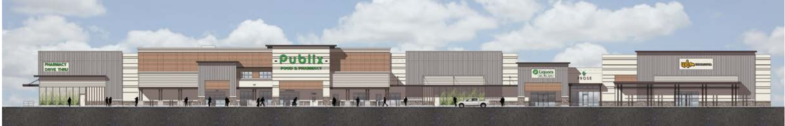
PUBLIX & JUNIOR ANCHOR FRONT ELEVATION

SIGNAGE REQUIREMENTS: 300 SQFT ALLOWED PROVIDED: (PUBLIX) 288.23 SQFT SIGNAGE SHOWN