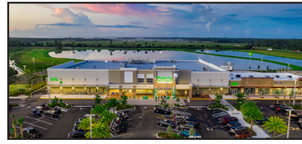
Crescent B shopping plaza opens offering convenient shopping, dining and service experiences including a Publix