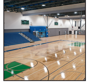
The Field House receives ICC 500 certification