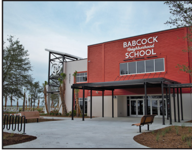
Babcock Neighborhood School opens in new permanent home on the central education campus