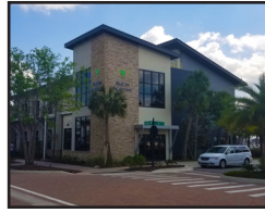
Bloom Academy opens in Founder's Square, providing daycare and Pre-K education