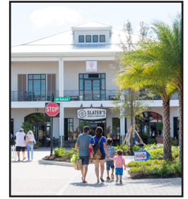
First residents move in; opening of Slater's and The Hatchery