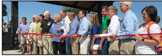
Founder's Fest marks opening of first model homes & Discovery Center