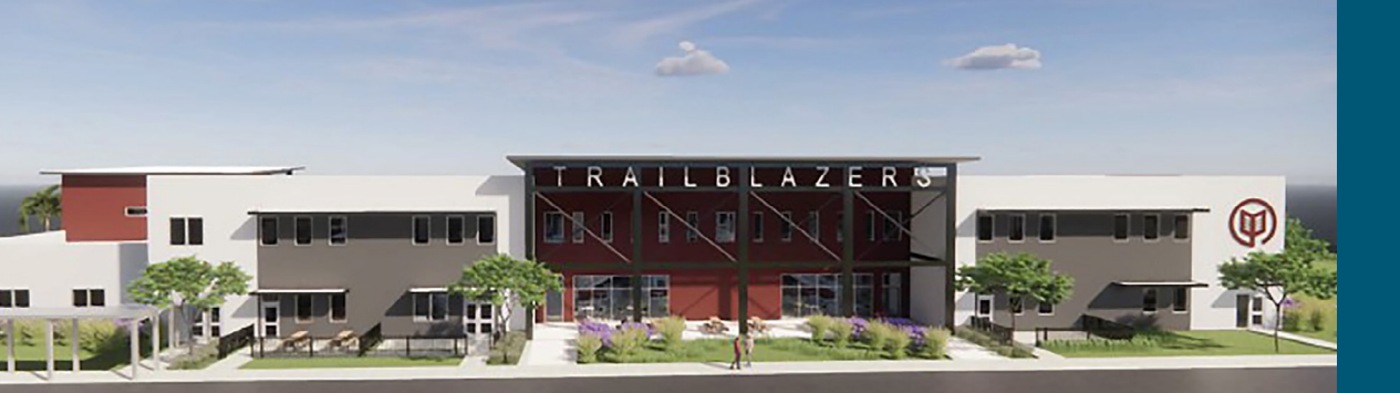
Next door to Babcock High School sits the Field House, which is outfitted with sports courts, a cafeteria, and theater space. It will double as an emergency shelter and community event space.

Opening in 2022 and built with sustainable materials, Babcock High School will offer students collegiate-level experiences, with facilities for agricultural and environmental science, computer and IT labs, a media lab for graphic design, a sound and video production studio, an art studio, a large robotics, laser, and 3-D printer lab.