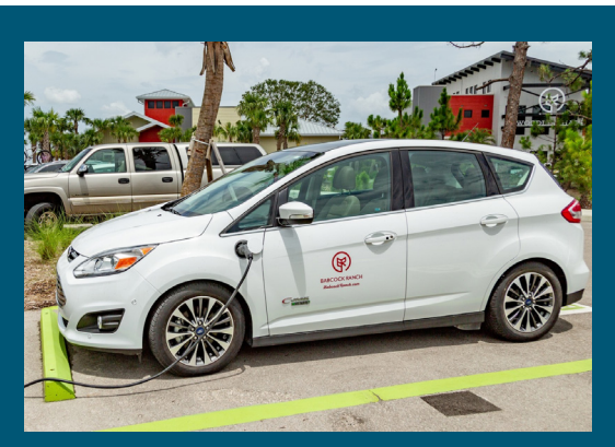
SOLAR CAR CHARGING STATIONS - Clean energy goes beyond what's powering homes and businesses. That's why we have installed electric vehicle (EV) charging stations throughout this community.